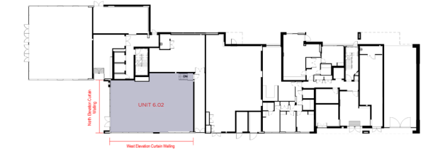
Unit 6.02 - North Elevation Unit 6.02 - West Elevation