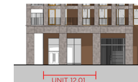
Unit 12.01- West Elevation